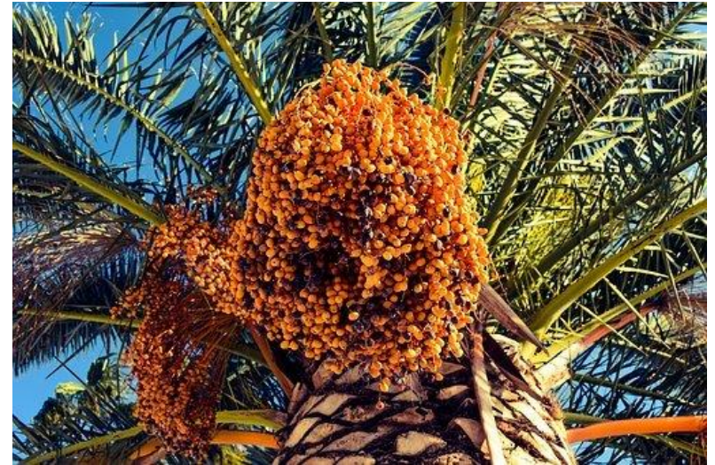
4. Fasting on Day of 'Arafah