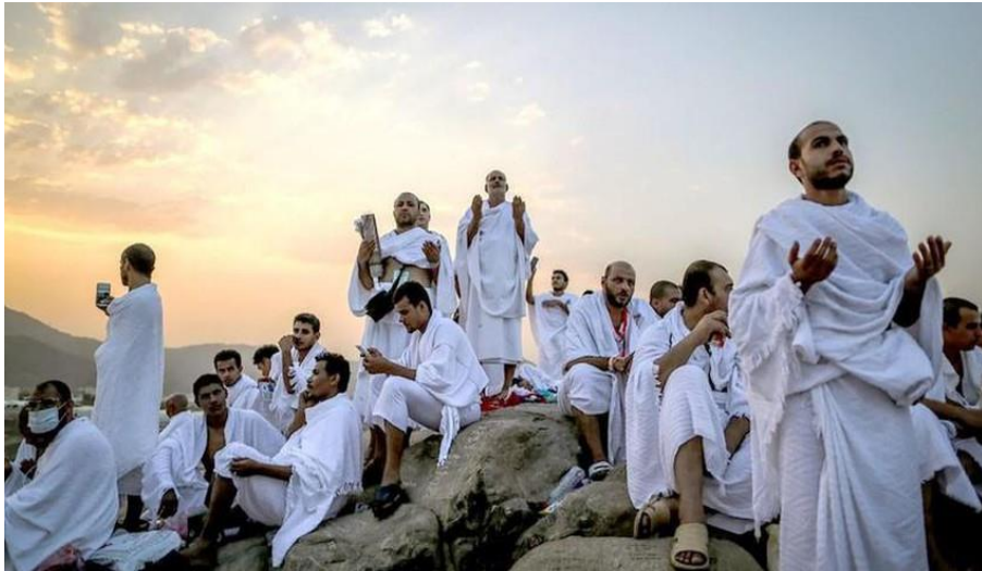
3. Du'a on Day of 'Arafah